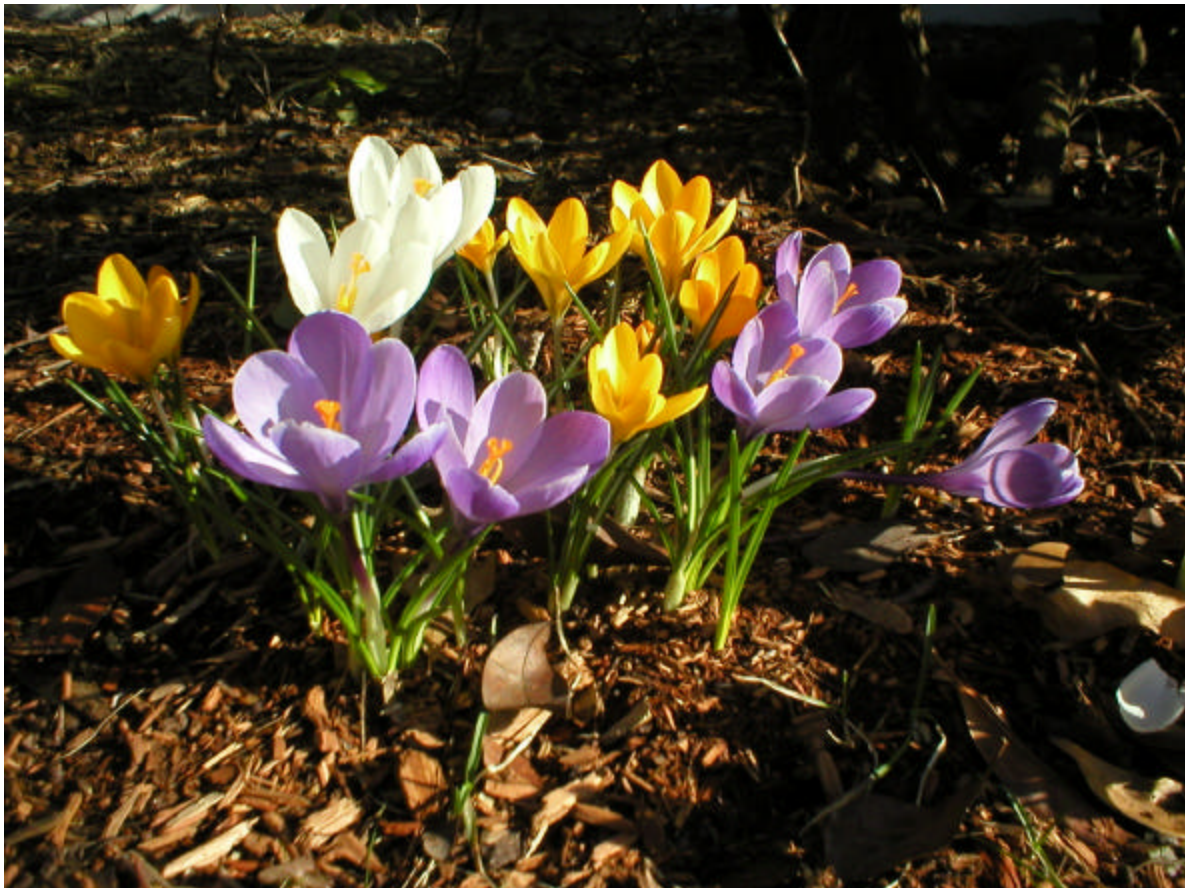
Crocuses (Crocus?), April, 2005

Please remember to distribute your Save-the-Date postcards to patients, colleagues, and friends who may wish to attend.